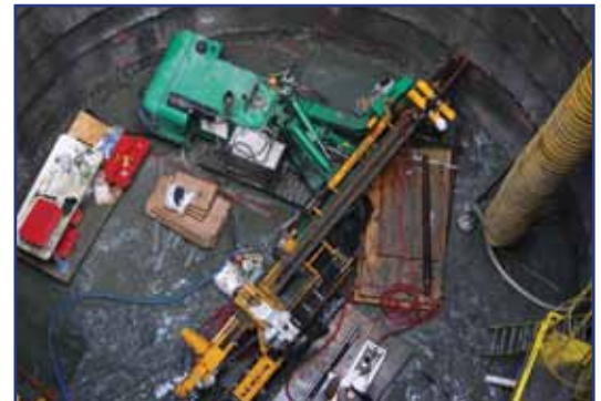
Packer testing in a 70ft deep by 30ft diameter shaft with Gregg's Mito drill rig