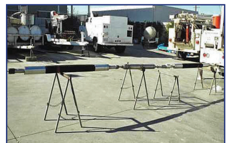
A straddle packer assembly is used to isolate pumping zones in a test well