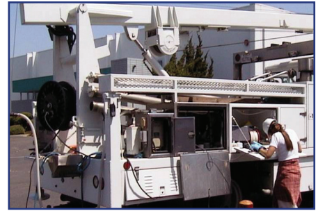
Water quality monitoring cabinet