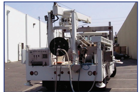
Pump/Development rigs are equipped with low clearance shieve blocks