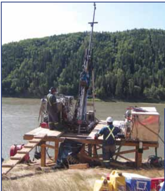
Above: Angled drilling on a slope