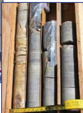
Right: Sample cores