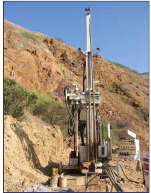
Drilling on a slope with track-mounted Fraste rig