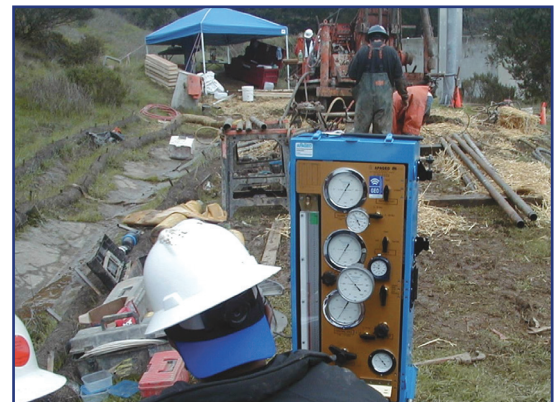
Gregg Drilling's Menard Pressuremeter can be used in conjunction with drilling to gain information about soil compressibility.

The Menard Pressuremeter measures in situ strength and deformation properties of all types of soil and soft rock as well as ice and permafrost. Well established correlations enable bearing capacity and settlement calculations.